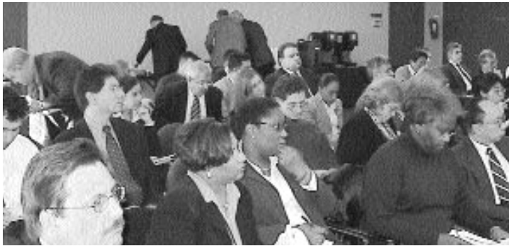
GNYHA members react to the details of Governor Pataki's proposed budget, which contains huge Medicaid cuts for hospitals and continuing care providers as well as new taxes imposed on hospitals and home health care providers.

programs. The Governor also proposes increasing surcharges on health care services and on "covered lives."